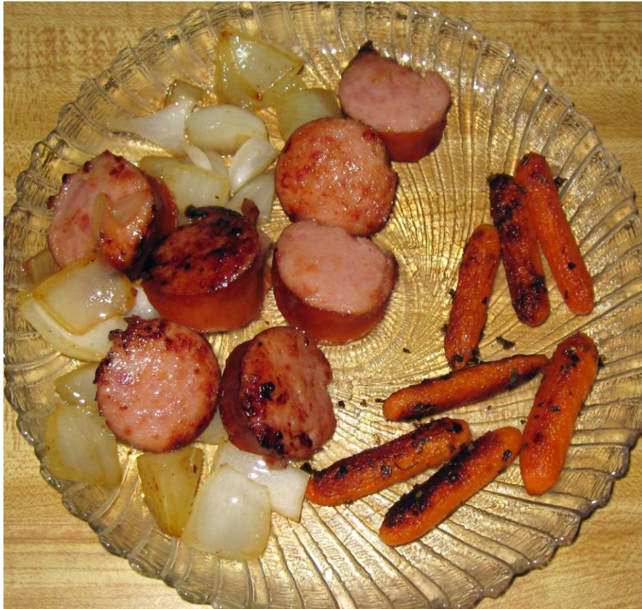
7 Polish Kielbasa, Onions, & 7 Braised Carrots