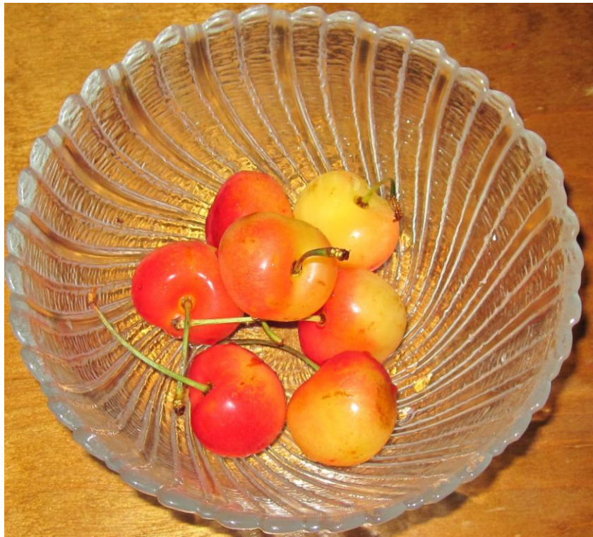
7 Rainier Cherries

If you're wondering why, where, when the number 7 was chosen, the answer is also simple. From ancient times to today, 7 has always been held in high regard in many cultures. Biblically, the number 7 often represents completeness, or perfection. In Genesis, the world was created in 7 days. Joshua and his army marched around Jericho seven times. In Revelation, John talks extensively of the seven churches, seven seals, etc. In music, the musical scale has seven notes. The human head has seven holes and the human ankle seven bones. Okay, you get the idea, it's almost uncanny, If you are so inclined you can spend hours researching the number seven.