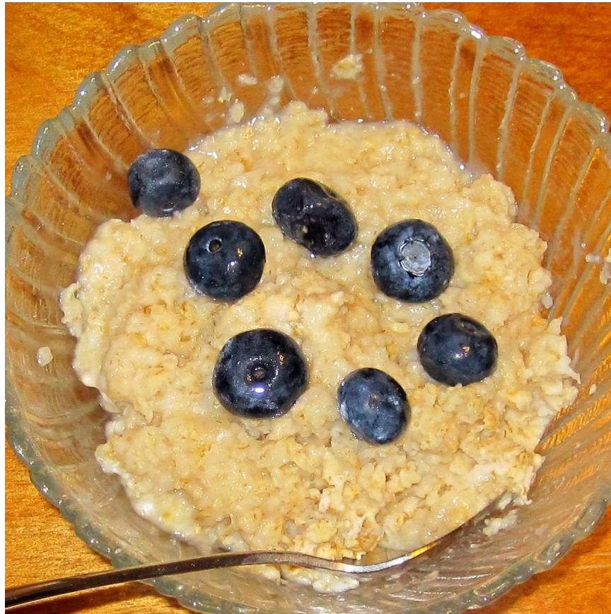
7 Spoons of Oatmeal and 7 Blueberries

I trust you get the idea. Each day should include regular meals, 6-7. As you are eating less at every meal or snack, you need them regularly to keep up your energy.